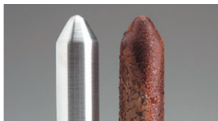
PURITY FG Specialty Chemical Company

Unlike a leading chemical company's fluid, PURITY FG Trolley Fluid passes the demanding ASTM rust test (Sequence A & B). This strong level of corrosion protection can extend equipment life in the wettest operating conditions while protecting food products from rust contact.